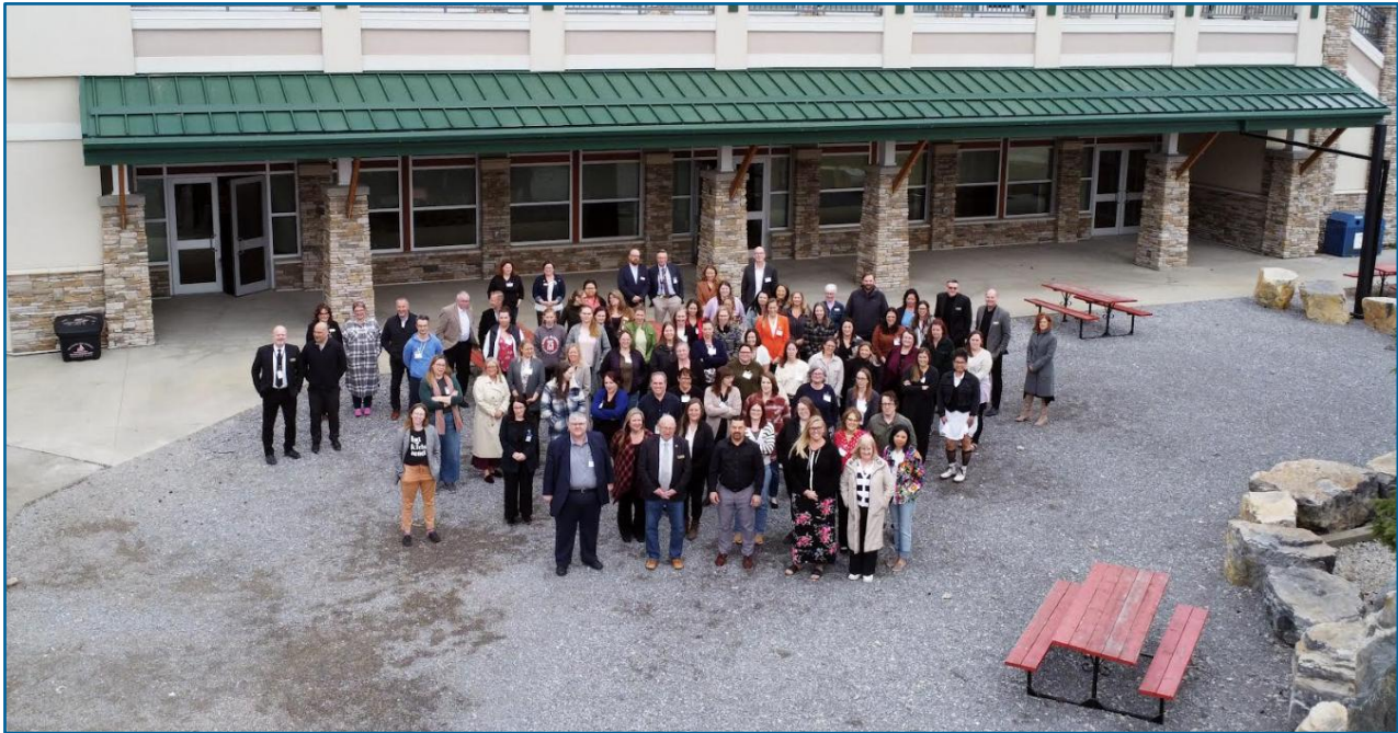
Education Planning Day 2025 – Participants

The Annual Education Planning Day, hosted by the Parkland School Division Board of Trustees on April 16th, 2025, gathered approximately 75 stakeholders (30 administrators, 45 parents) to address curriculum delivery, assessment, support systems, and wellness. Participants provided robust insights and key recommendations for improvement. These emphasized the need for better resourcing, clearer communication, and consistent support to meet diverse student and staff needs. Specific calls to action included reducing curricular pressures, enhancing direct specialist support, improving parent and student understanding of assessment, strengthening family-school partnerships, implementing holistic wellness education, managing technology impacts, and prioritizing teacher/staff wellness to foster sustained success across the division.