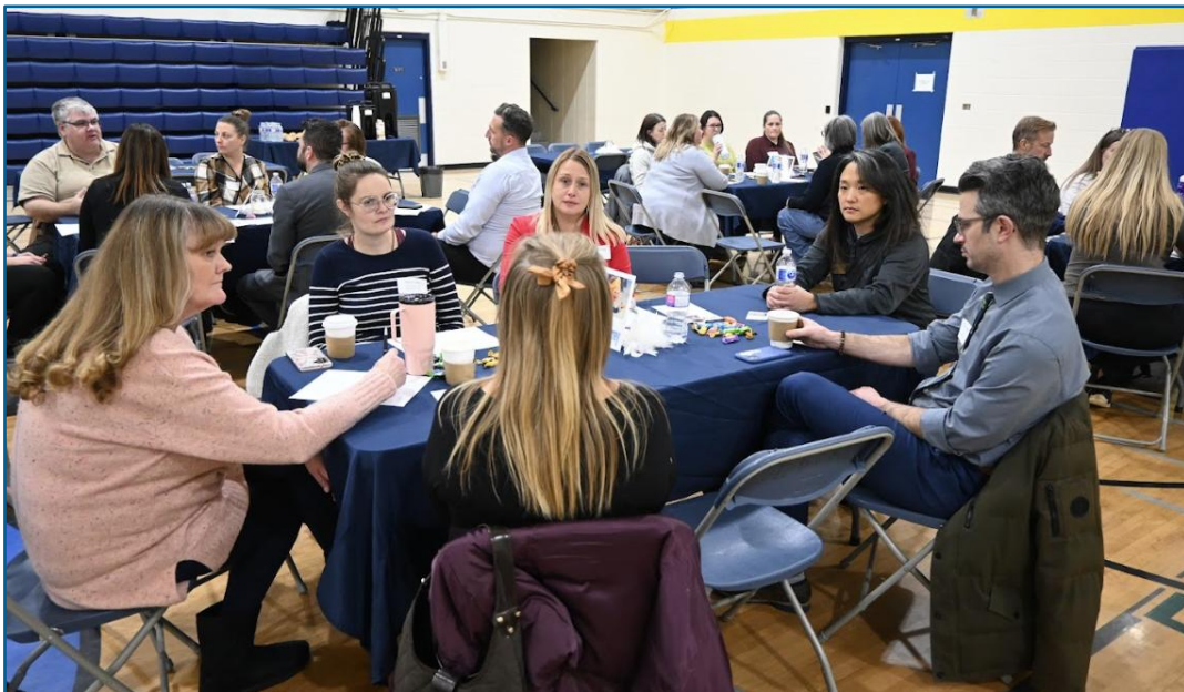
Board of Trustees, Parents and Staff at the Fall Stakeholder Engagement