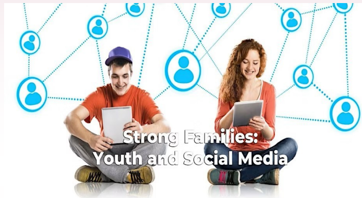
Strong Families: Youth and Social Media