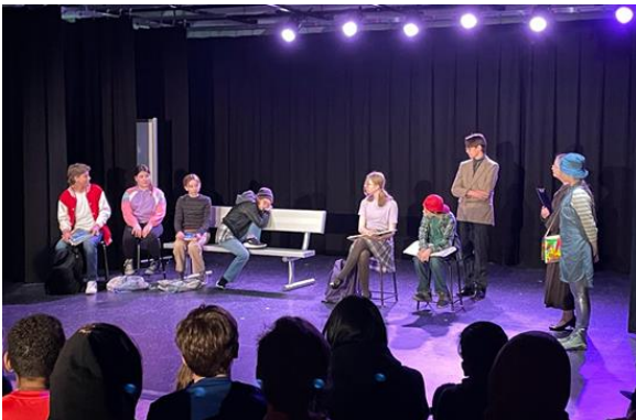
Woodhaven Middle School