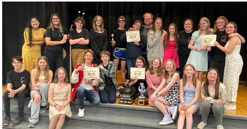
Woodhaven Middle School wins big at the Zone II West One Act Play Festival in Edson.