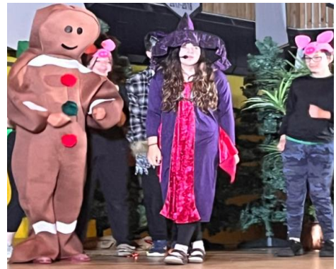
Duffield School: Shrek, The Musical