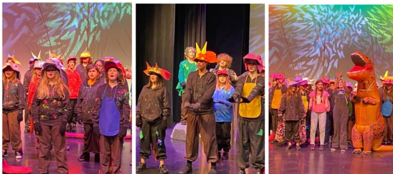
Dinosaurs Before Dark at Stony Plain Central

Art Club, Spirit Team, One Acts, Handbells, Comic Book Club, Dance Club, Coloring Club, Knitting Club, Knitting Club, Crafting Club, Hands on Club, Drama Club, Ukulele Club, E-Sports Club, Cheer Club, Open Door Karaoke, Pony Awards.