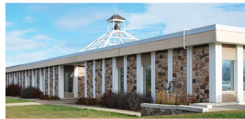
4603-48 Street, Stony Plain, AB Phone: 780-963-4010